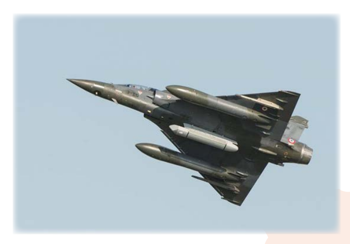
A Dassault Mirage 2000D carrying out a mission in the Black Sea region