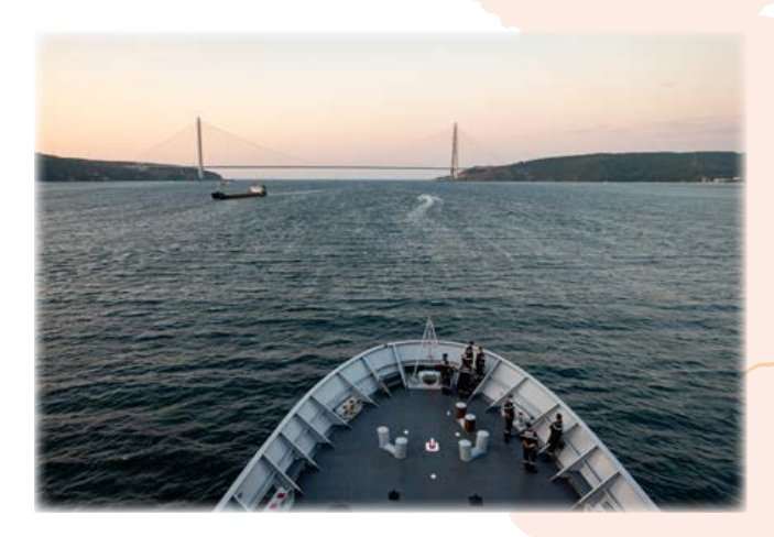
The French command and replenishment ship Var , which sailed from the naval base in Toulon on July 2020, is about to pass under the last Bosphorus Bridge before entering the Black Sea