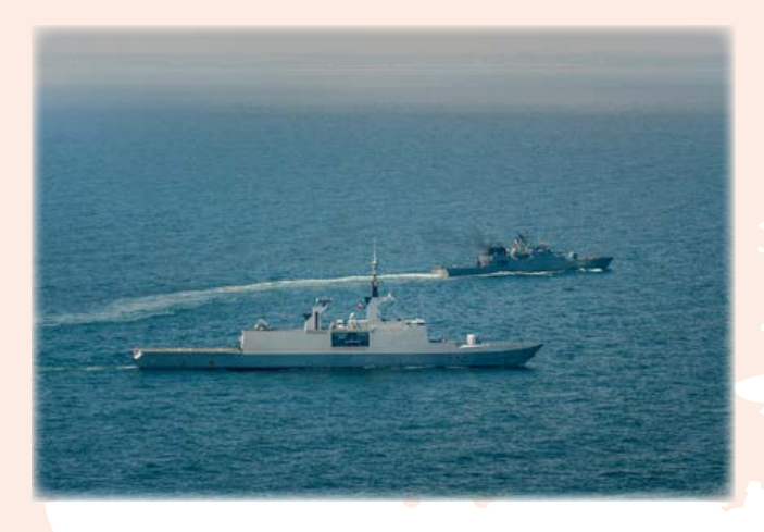
Exercise between the French furtive light frigate La Fayette and the Romanian frigate Hora Macellariu in the Black Sea on march 2017 (French furtive light frigate La Fayette in the foreground)