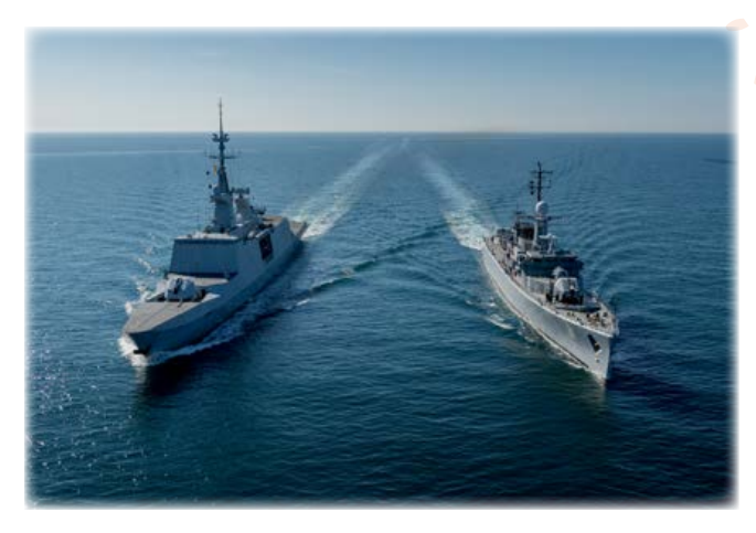
Exercise between the French furtive light frigate La Fayette and a Bulgarian frigate, the Drazki , in the Black Sea off Bulgaria on March 2017 (French furtive light frigate La Fayette on the left)