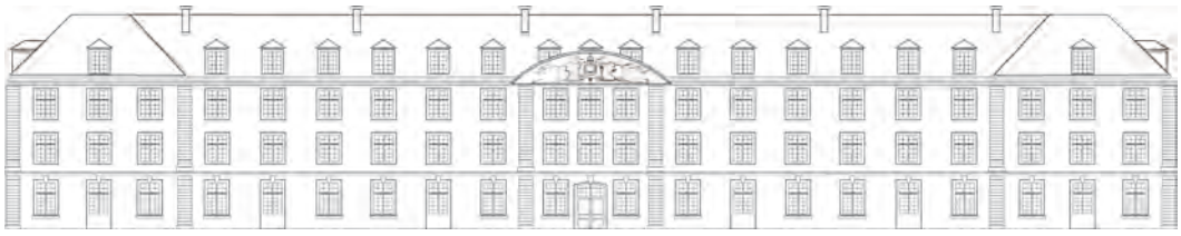
IRSEM is housed in building 13 (dating to 1855), Ecole militaire, Paris.