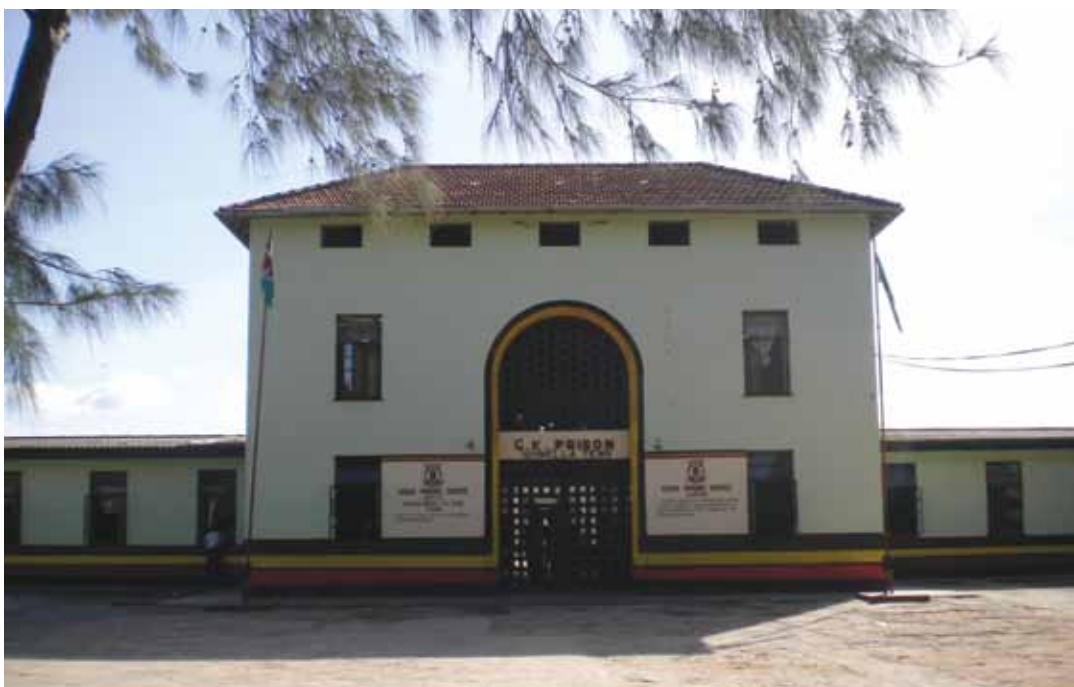
Mombasa's Shimo La Tewa Prison.

"Rehabilitation is an integral part of the justice process-if prisoners do not understand that what they have done is wrong, and if they are not equipped with alternate tools for when they are released, we cannot counter recidivism."