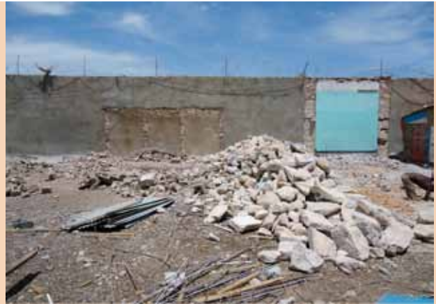
Prison refurbishment work at Bosasso in Puntland's north. An extra 200 prisoners can be accommodated once the work is completed. A new prison is to be built in Puntland's capital, Garowe.

UNODC has already completed refurbishing work on Hargeisa Prison in Somaliland and it was officially handed over to Somaliland by Executive Director Yury Fedotov on March 29. Work has already started on refurbishing and increasing accommodation in Puntland's overcrowded Bosasso prison.