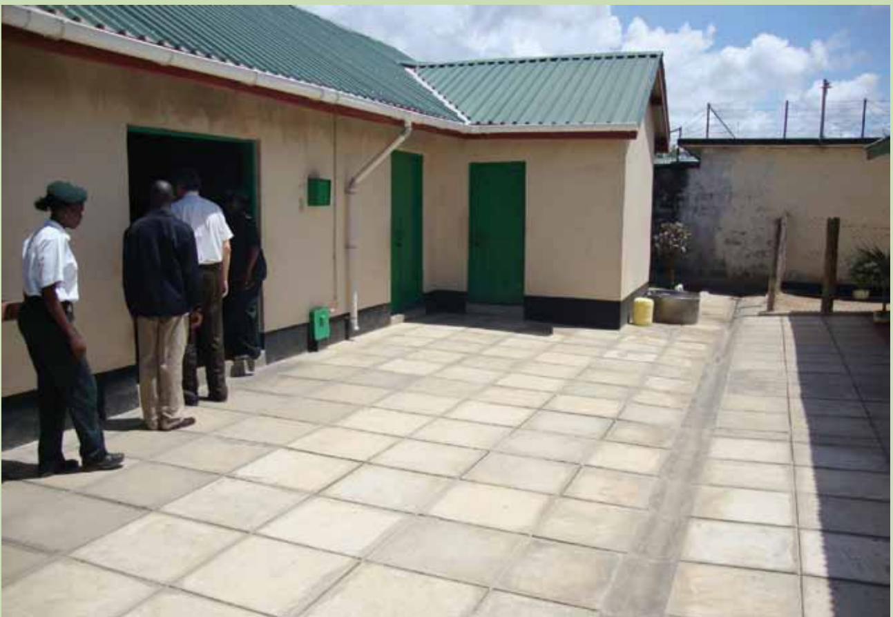
Exterior of the new women's kitchen, built by UNODC.

UNODC strives to make improvements across all areas of the sectors it works in. Shimo La Tewa Prison is no exception. The women's prison received substantial repairs, including an amazing transformation of the women's kitchen. UNODC has spent almost $US750,000 on refurbishing several Kenyan prisons.