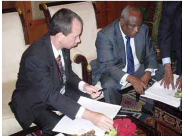
Seychelles Minister for Interior Joel Morgan with Puntland's Counter Piracy Minister Mr Saeed Mohamed Rage signing prisoner transfer agreements in Dubai.

UNODC also recently facilitated two transfers of acquitted Somali men from Kenya and Seychelles and both missions, whilst costly and extremely complex, were completed successfully.