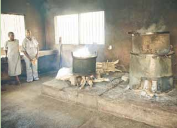
Shimo La Tewa prison women's kitchen in April 2010 ...