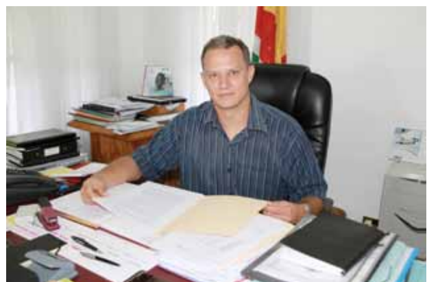
Seychelles Minister of Foreign Affairs Jean-Paul Adam says more needs to be done to combat piracy.

The minister points out that about 600 people are being held hostage in Somalia. “If you lose 600 of any one nationality to pirates like that, it would long ago have been deemed unacceptable,” he says. It's fair to say that the minister and some of his colleagues feel that if the outside world was as threatened as the Seychelles, then there would be more action and with much more urgency.